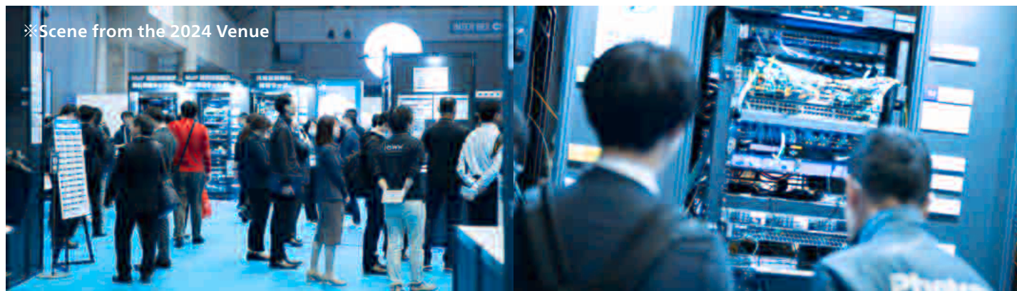
※Scene from the 2024 Venue